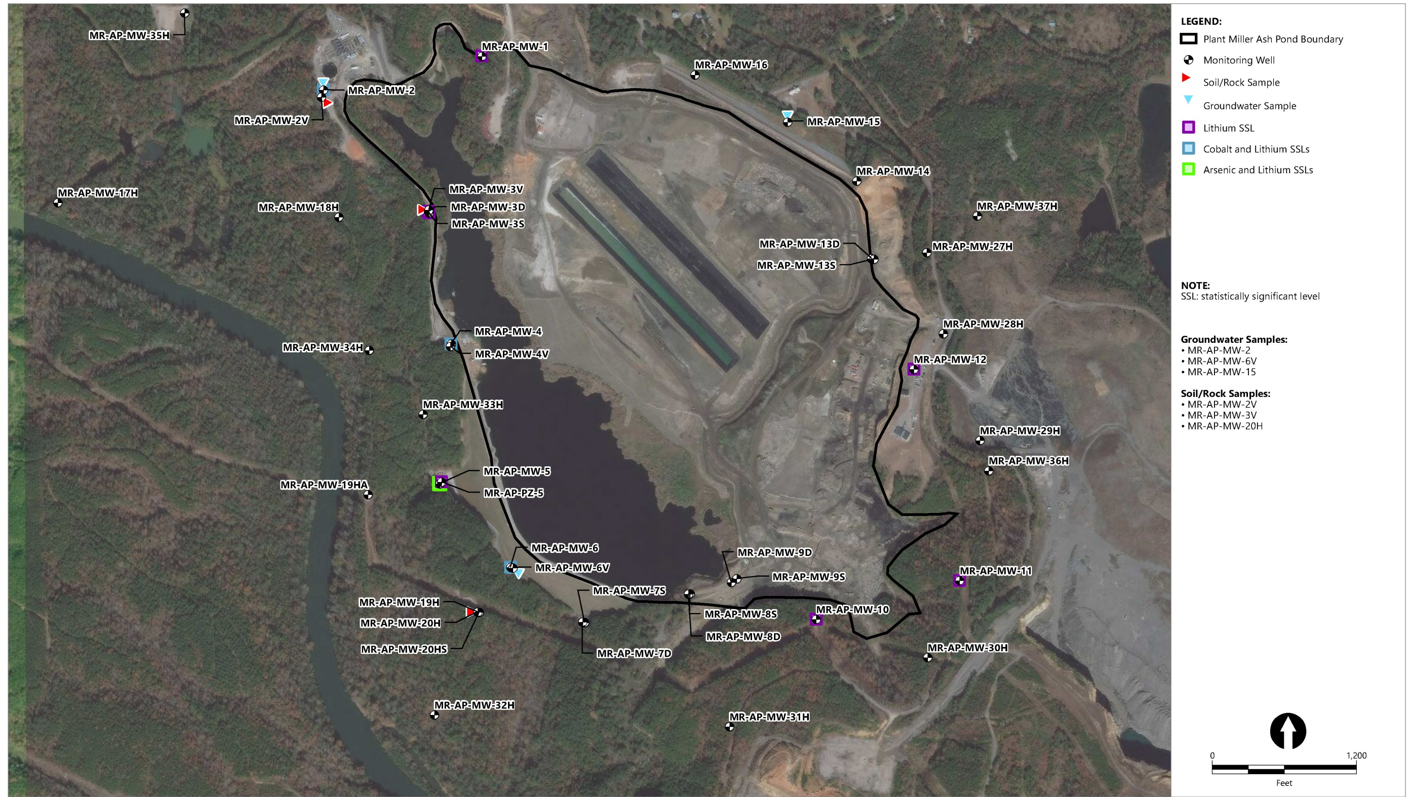
Figure 1 Soil and Groundwater Sampling Locations