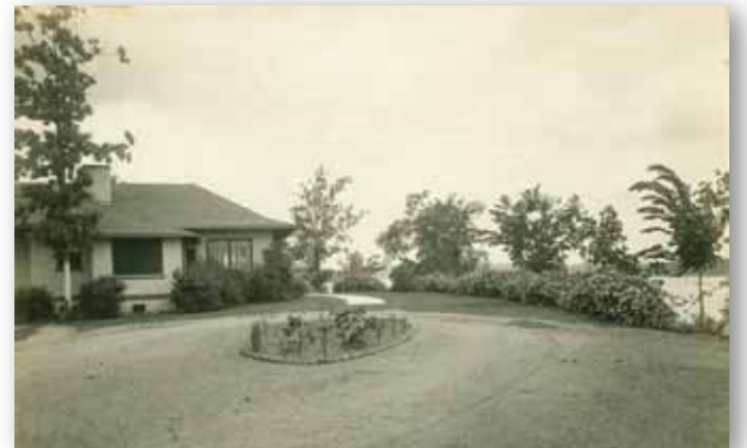
Another view of superintendent's house with a view of Lay Lake in the background.