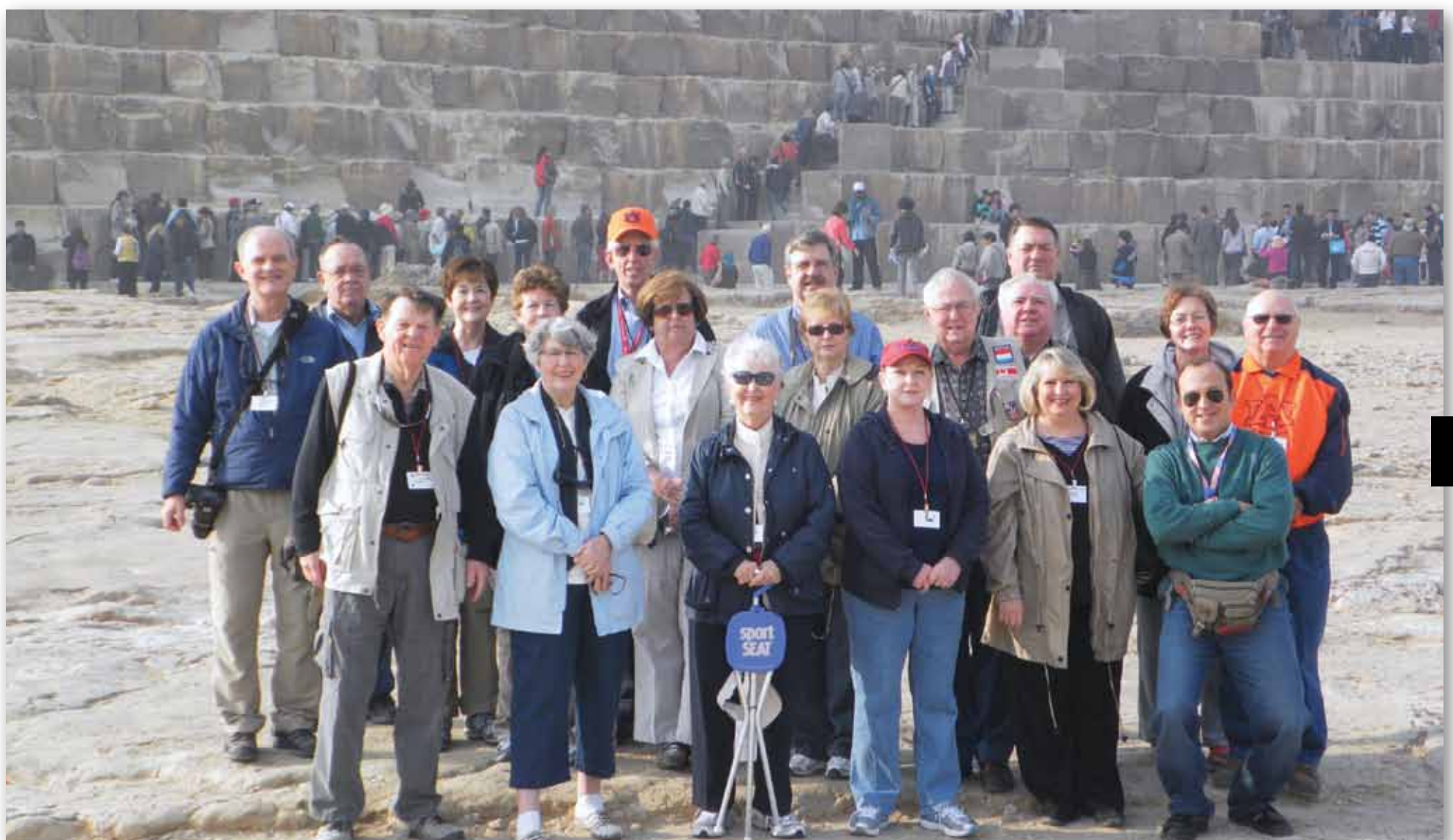
Energizers pose in front of The Great Pyramid of Giza, also called the Pyramid of Khufu.