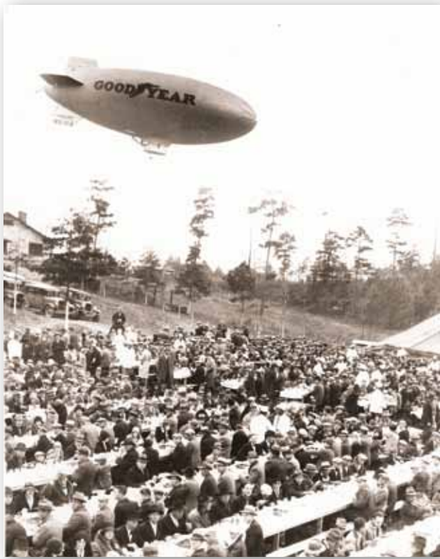
Employees and their families weren't the only ones to show up for the dedication. The Goodyear blimp was also there.