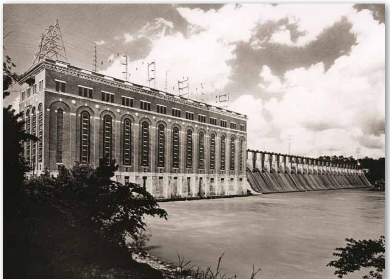
Undated photo showing the architectural beauty and wonderful brickwork of Lay Dam on the Coosa River.

Entertainment was provided also. A baseball team was formed and probably some of the players were hired to work for