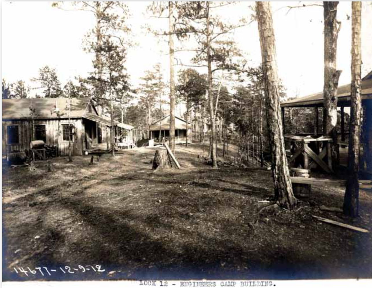
A December 9, 1912 photo of Lock 12 Engineers Camp Building.