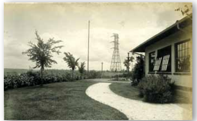
Lay Dam superintendent's home.