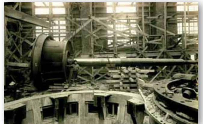
Interior view of the turbine at lock 12.