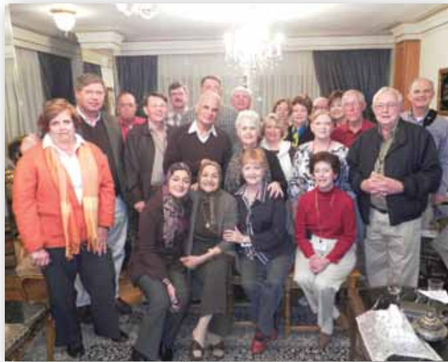
Energizers pose with host family in Cairo.

The Energizers Travel Group got 2011 off to an exciting start. We went to Egypt on January 22nd and arrived in Cairo just a couple of days before the political demonstrations got started. We spent the first 5 nights in Cairo, taking day trips out to the various sights. While in Cairo we visited the Pyramids of Giza, the Sphinx, The Museum of Antiquities and other sites. On Thursday of the first week, we took a train to the ancient