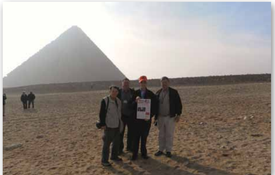
Energizers pause to read the Energizers Newsletter in front of the great Pyramid.

a 7 day cruise to seven Greek isles. The first Island visited is Patmos where John