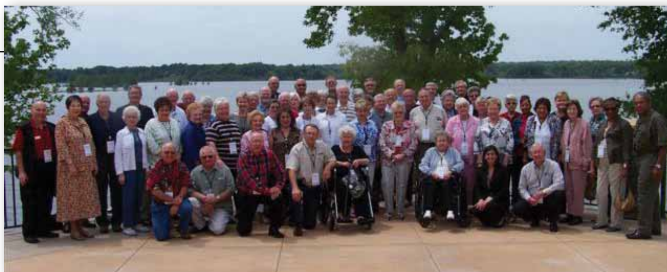
Group shot of the Energizers Leadership attendees on the Lake Point Resort patio overlooking the lake.

He explained the latest polling results, telling attendees, "Seventy percent of people polled think Alabama Power is a great company. Fifty-four percent say we are the best company in Alabama. That is a direct link to the job you all have done and