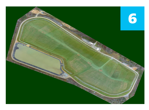
SECURELY CLOSED IN PLACE; DEWATERING ENDS 12/17