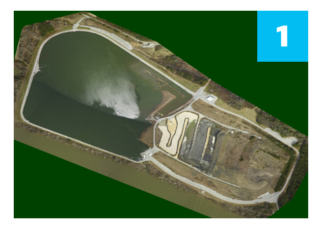
CLOSURE BEGINS 3/16