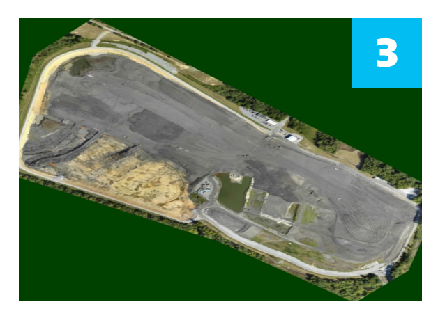
INITIAL CONSOLIDATION 9/16